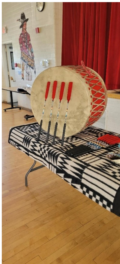
A drum from the Calling Back Our Spirit workshop (Photo credit: UICSL).

UICSL's Special Diabetes Program for Indians (SDPI) incorporates standard medical interventions, nutrition, and traditional practices to best treat the patient, their community, and their needs.