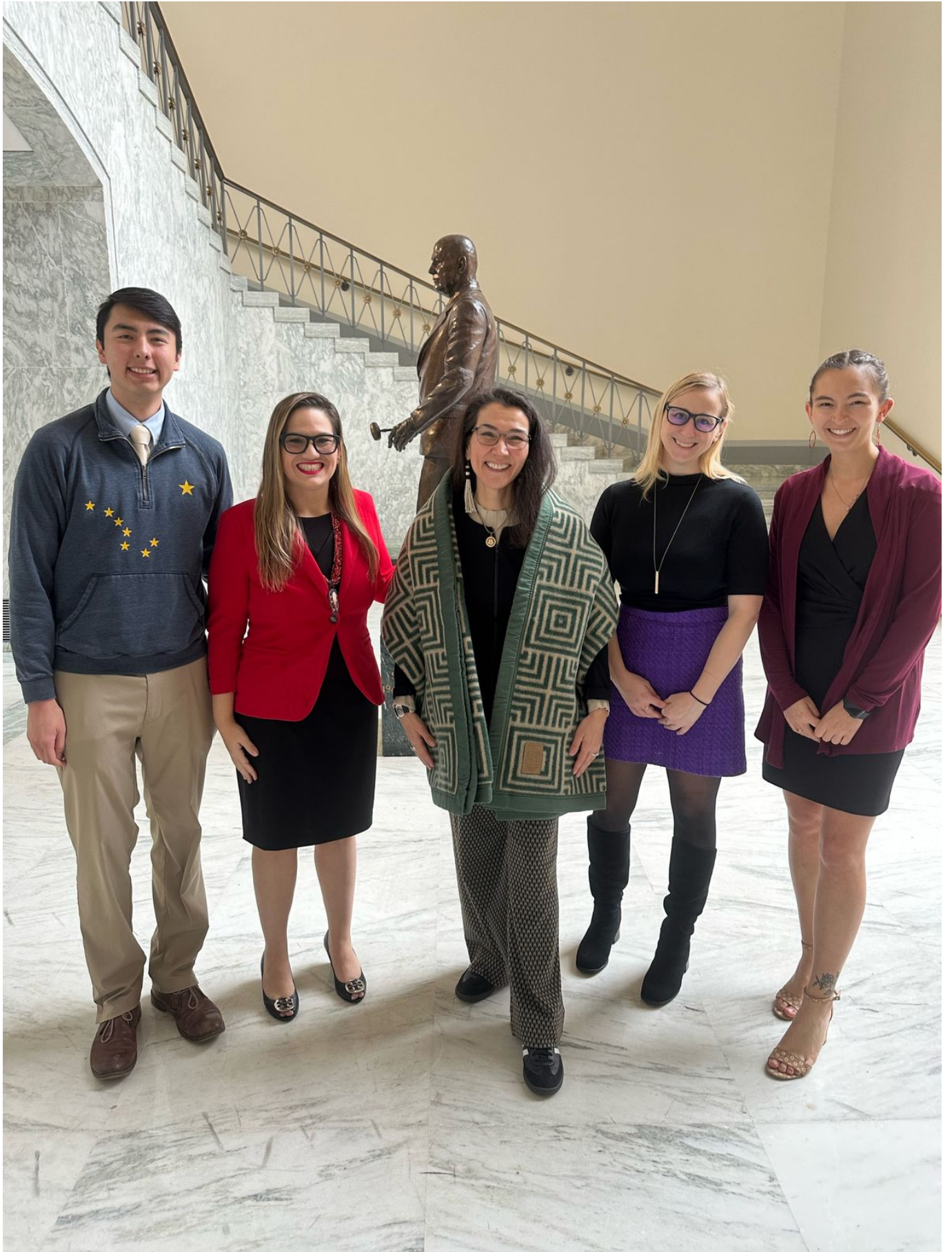
NCUIH staff and Representative Mary Sattler Peltola (D-AK).

On December 11, 2024, NCUIH presented two Good Medicine Awards to Members of Congress for