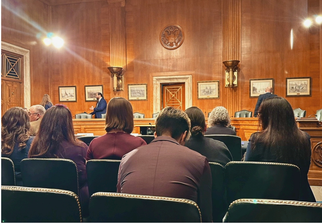
Senate Committee on Indian Affairs (SCIA)

On February 8, the Senate Committee on Indian Affairs (SCIA) held a hearing that includes an NCUIH-endorsed bill, the IHS Workforce Parity Act (S.3022), which expands healthcare provider access to IHS scholarship and loan repayment programs.