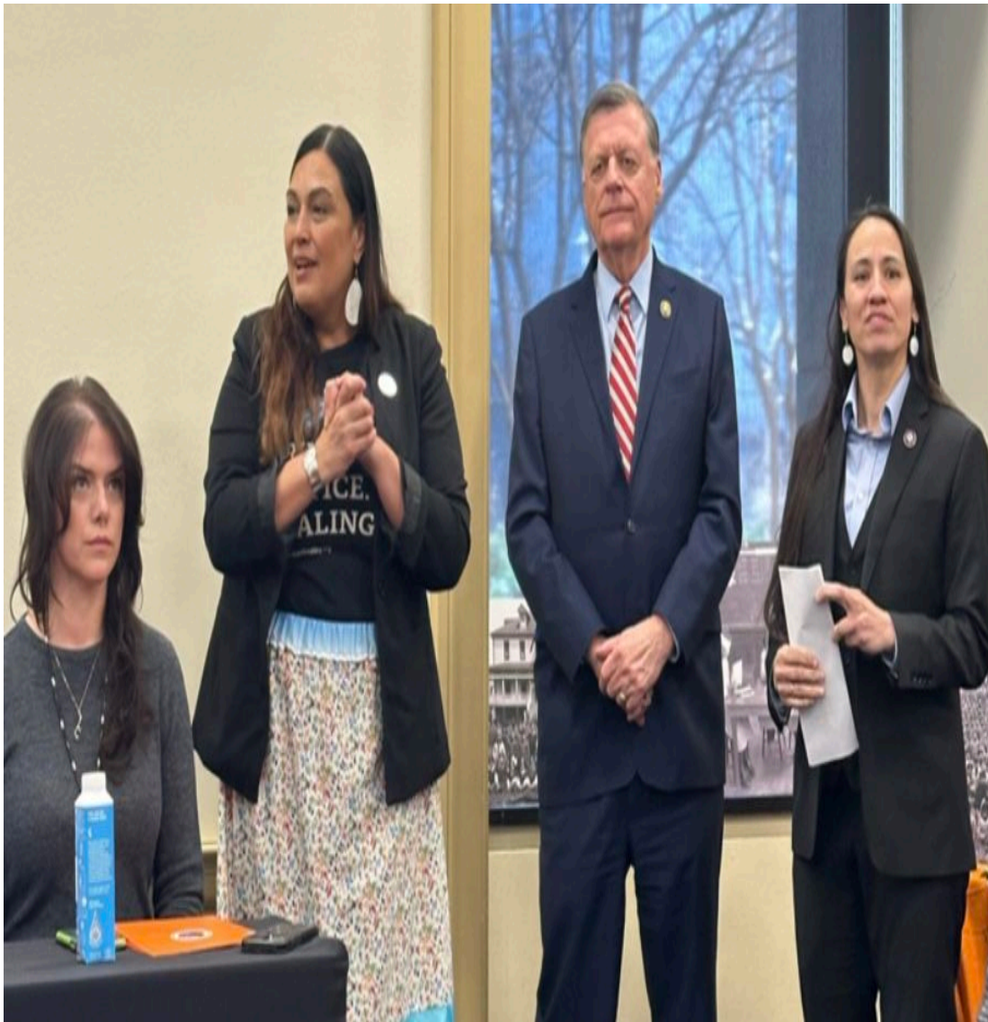
Representative Cole (R-OK) and Representative Davids (D-KS)