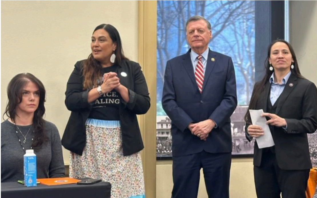
Representative Cole (R-OK) and Representative Davids (D-KS)

On February 14 , NCUIH represented UIOs at the National Native American Boarding School Healing Coalition (NABS)'s lunch & learn with Congressional Native American Caucus Co-Chairs, Reps. Tom Cole (Chickasaw) (R-OK-04) and Sharice Davids (Ho-Chunk) (D-KS-03) regarding the Truth and Healing Commission on Indian Boarding School Policies Act of 2024 (H.R. 7227).