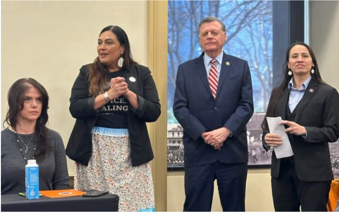
Representative Cole (R-OK) and Representative Davids (D-KS)

On February 14 , NCUIH represented UIOs at the National Native American Boarding School Healing Coalition (NABS)'s lunch & learn with Congressional Native American Caucus Co-Chairs, Reps. Tom Cole (Chickasaw) (R-OK-04) and Sharice Davids (Ho-Chunk) (D-KS-03) regarding the Truth and Healing Commission on Indian Boarding School Policies Act of 2024 (H.R. 7227).