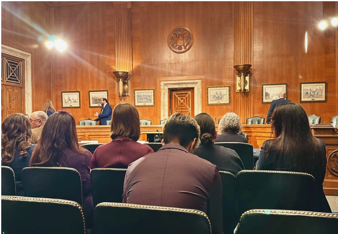
Senate Committee on Indian Affairs (SCIA)

On February 8, the Senate Committee on Indian Affairs (SCIA) held a hearing that includes an NCUIH-endorsed bill, the IHS Workforce Parity Act (S.3022), which expands healthcare provider access to IHS scholarship and loan repayment programs.