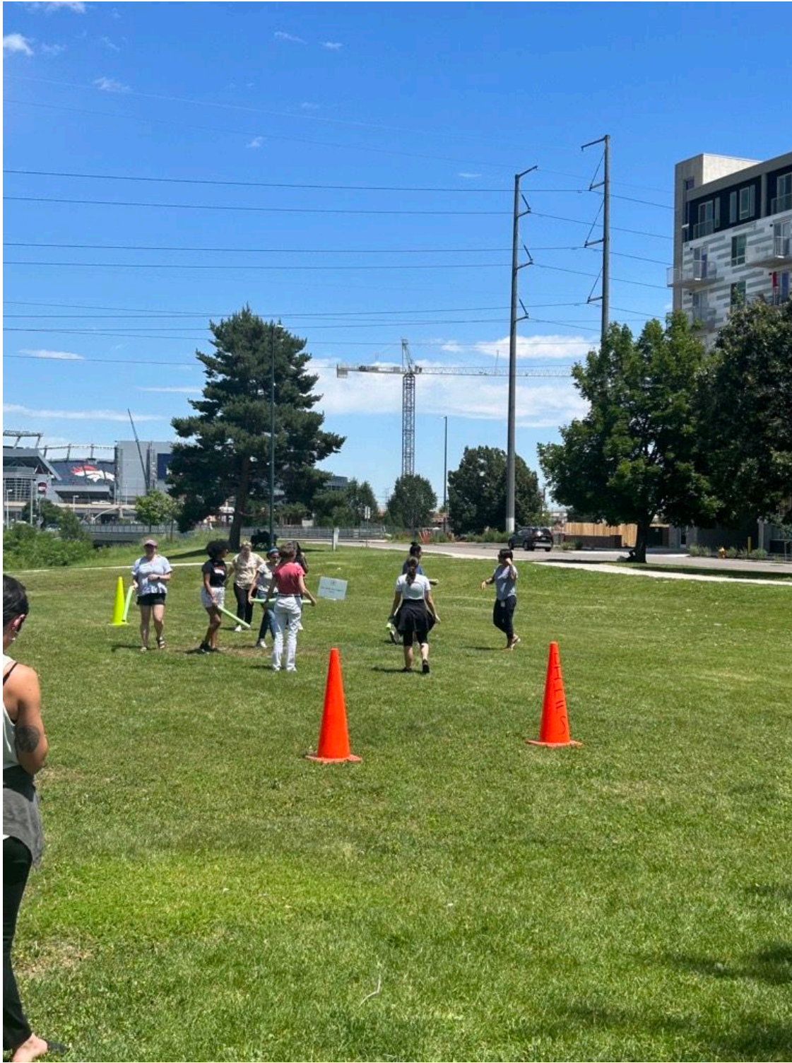
NCUIH staff participate in a cultural wellness activity hosted by the Denver UIO.