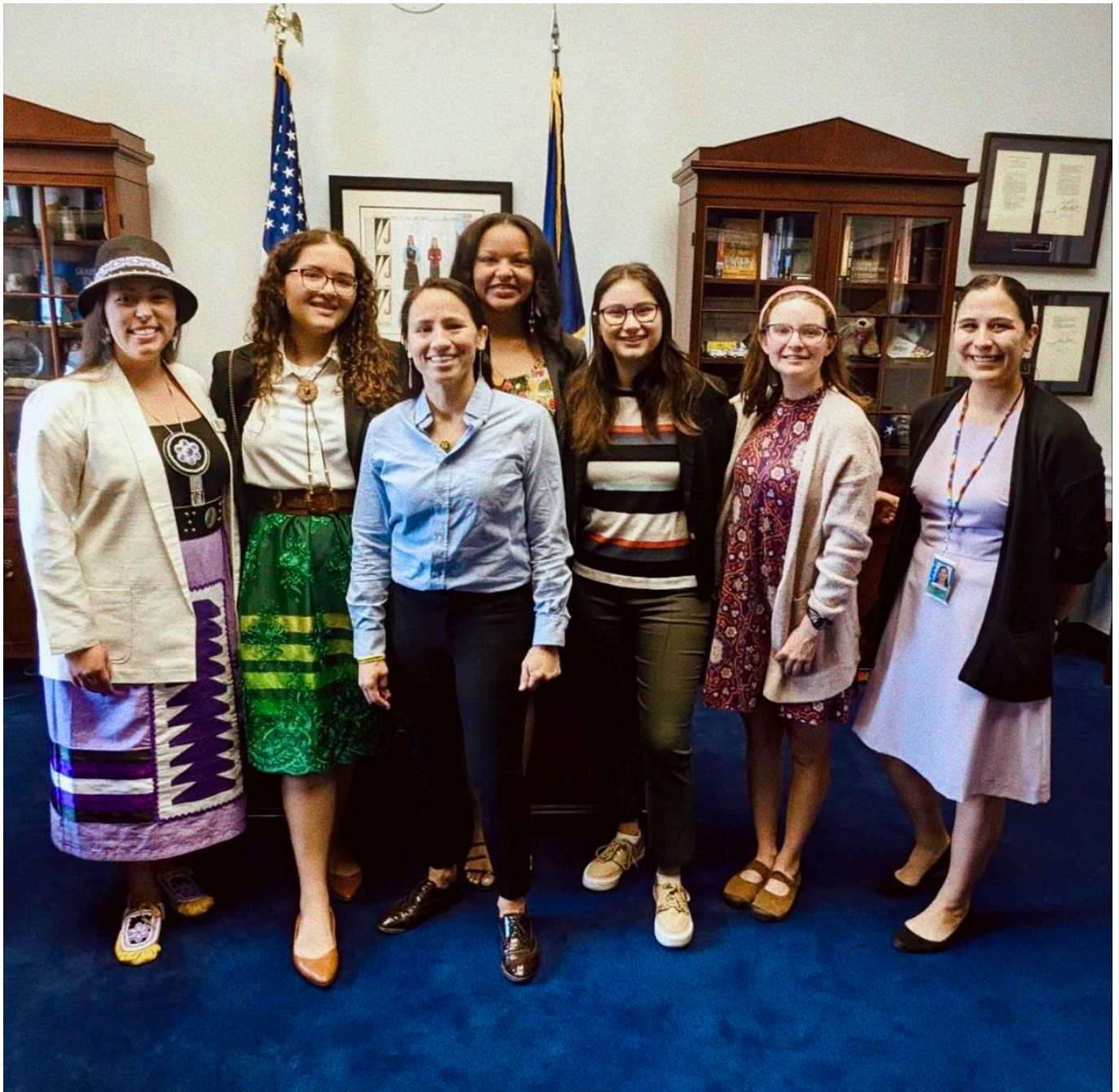
NCUIH Youth Council members and Representative Sharice Davids (D-KS)

During NCUIH's annual conference last month, Youth Council members had the opportunity to visit Capitol Hill and meet with elected officials, including Representative Sharice Davids and Senator Tina Smith, to discuss matters dear to them such as voting and access to mental health resources.