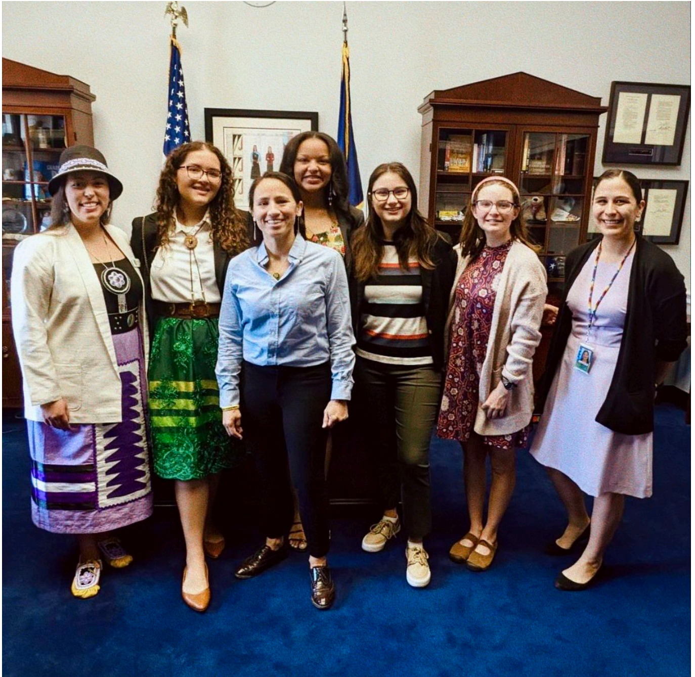
NCUIH Youth Council members and Representative Sharice Davids (D-KS)

During NCUIH's annual conference last month, Youth Council members had the opportunity to visit Capitol Hill and meet with elected officials, including Representative Sharice Davids and Senator Tina Smith, to discuss matters dear to them such as voting and access to mental health resources.